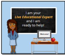
Click the picture for a virtual tour of the Connect with LEE website!